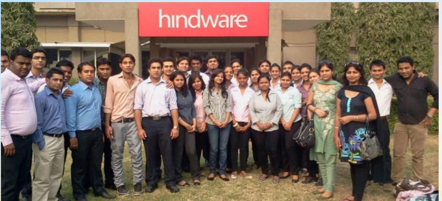
Visit to Hindware