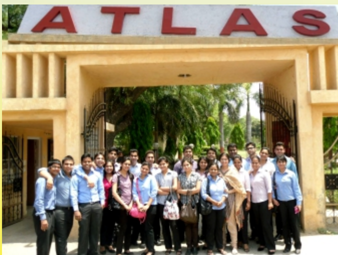
Visit to Atlas