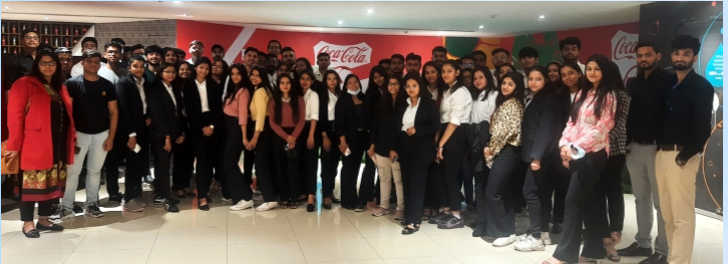
Visit to Cocacola