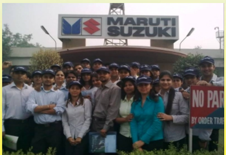
Visit to Maruti Suzuki